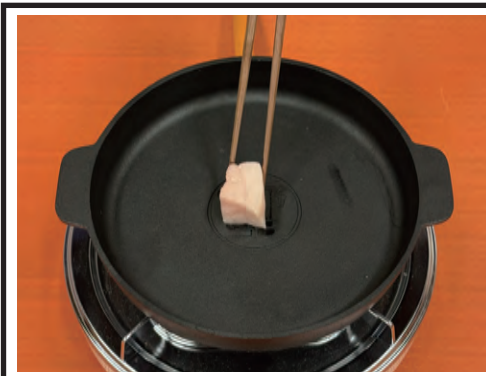
1.Heat the pan and spread beef fat all over it