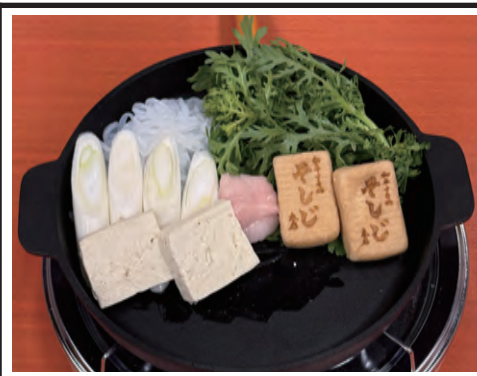
2.Start by grilling the konjac noodles, mizuna greens, green onions, wheat gluten cakes, and tofu.