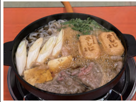
5.Once the pot starts boiling and the meat is slightly pink, it's ready. Enjoy the flavors soaked into the tofu and wheat gluten cakes as well.