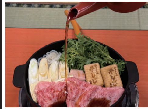
4.Pour in a moderate amount of warishita sauce. If the flavor becomes too strong, adjust it by adding kombu dashi.