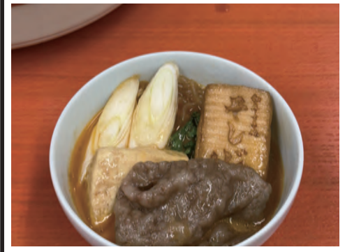
6.Dip each bite into beaten raw egg and enjoy!