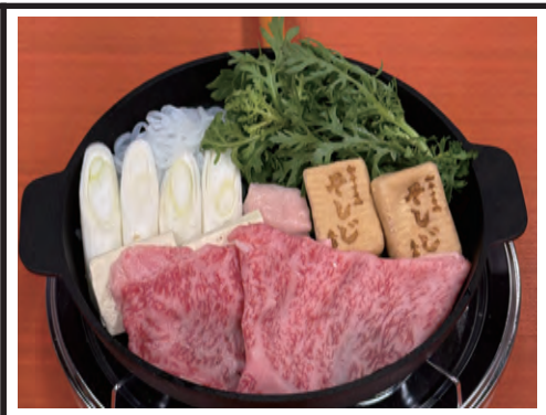
3.Add the beef to the pan, placing it next to the konjac noodles (Note:Placing meat directly next to konjac noodles can make it tough.)