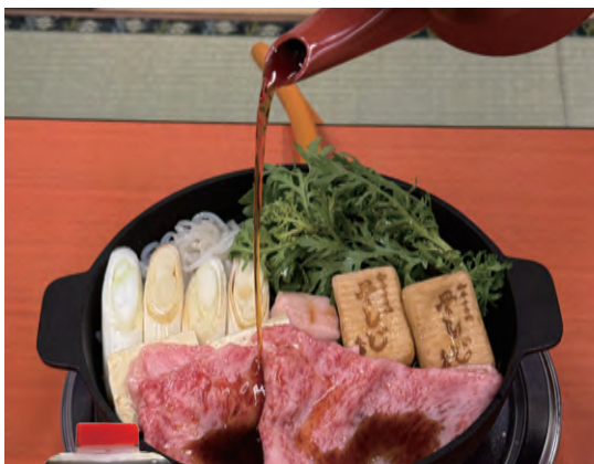
Sweet soy-based sauce