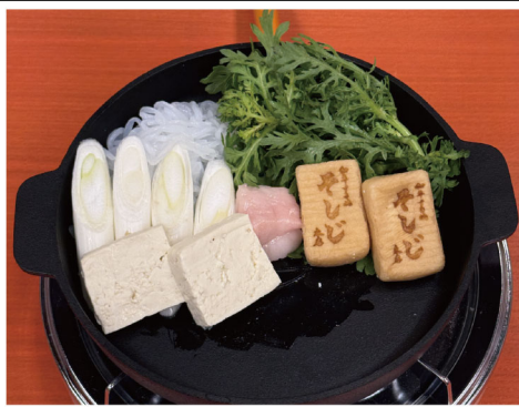
2.Start by grilling the konjac noodles, mizuna greens, green onions, wheat gluten cakes, and tofu.