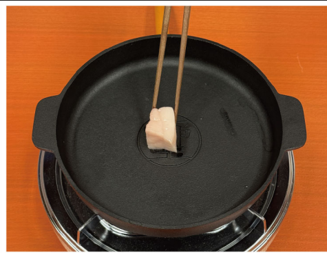
1.Heat the pan and spread beef fat all over it