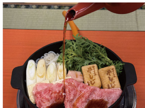
4.Pour in a moderate amount of warishita sauce. If the flavor becomes too strong, adjust it by adding kombu dashi.