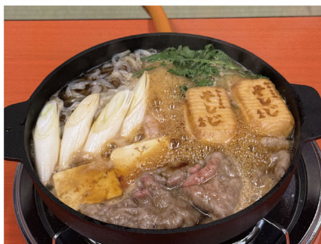
5.Once the pot starts boiling and the meat is slightly pink, it's ready. Enjoy the flavors soaked into the tofu and wheat gluten cakes as well.