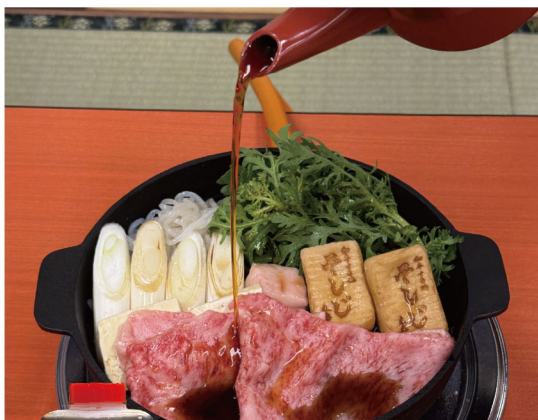
Sweet soy-based sauce