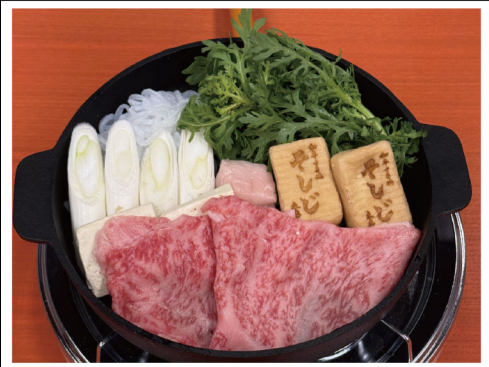
3.Add the beef to the pan, placing it next to the konjac noodles (Note:Placing meat directly next to konjac noodles can make it tough.)