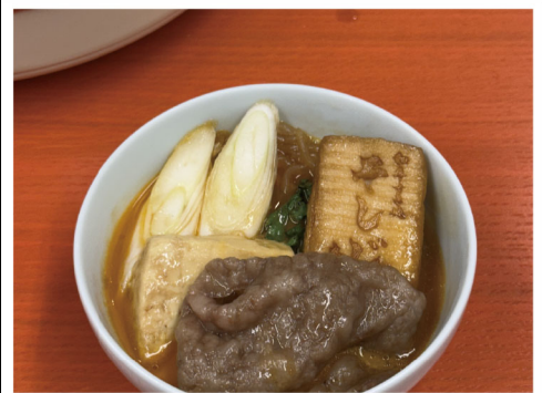
6.Dip each bite into beaten raw egg and enjoy!